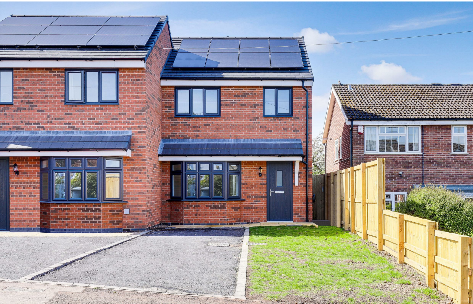
Carmel Gardens, Arnold, Nottinghamshire NG5 6LW